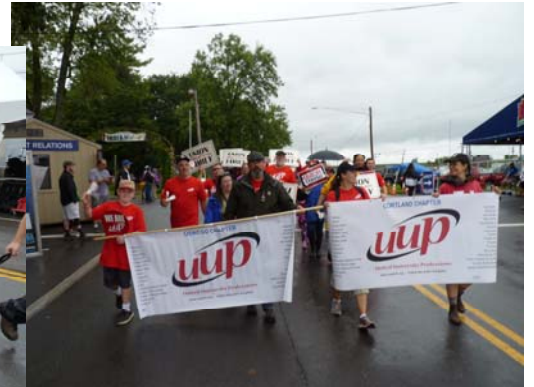
Cortland and Oswego Chapters March Together