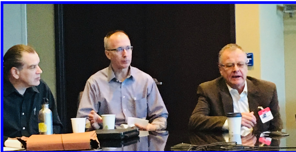
Good discussion at the Polytechnic - Albany Chapter Meeting