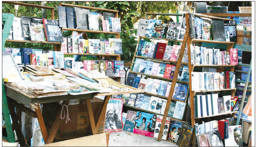
Above is a bookstall on the streets of Havana.