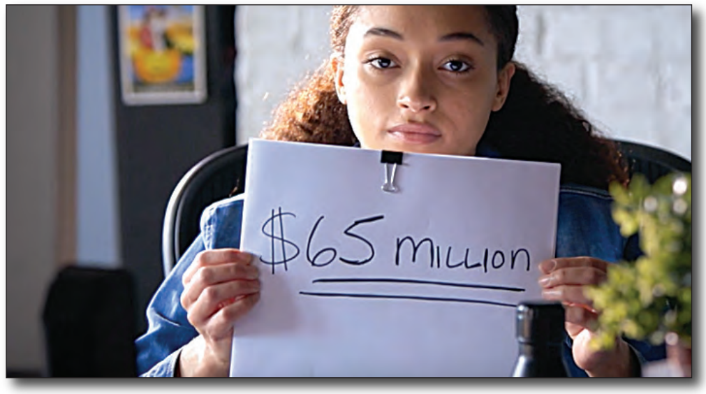
UUP produced a 30-second video ad for a social media campaign to press state lawmakers to provide an additional $65 million to the Tuition Assistance Program.

TAP provides access to a public college education—which is still out of reach for many qualified students. Yet the state, which covered the full cost of TAP until 2011, has reduced its TAP funding, forcing SUNY campuses to make up the shortfall.