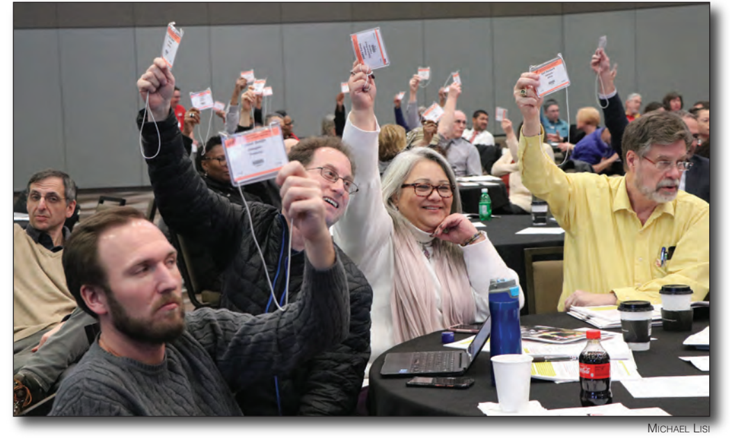
FREDONIA AND ALFRED DELEGATES, FRONT ROW, RAISE THEIR BADGES IN SUPPORT OF A CONSTITUTIONAL AMENDMENT TO ELIMINATE ONE DELEGATE ASSEMBLY A YEAR. UUP LEADERS DEBATED 13 RESOLUTIONS.

• Change the UUP Constitution to give the DA authority to take up matters decided by referendum from the third to the second subsequent DA. The amendment maintains the union's existing oneyear waiting period after a referendum has passed before any modifications can occur.