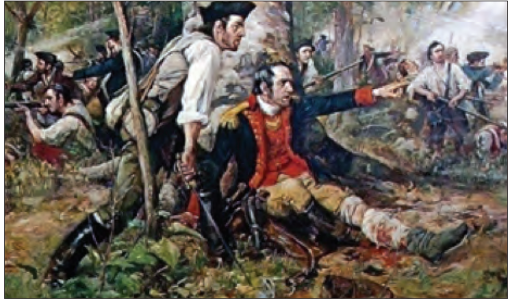
Gen. Nicholas Herkimer

Stanwix where they met stiff resistance by 100 Continental Army soldiers stationed within the wooden stockaded ramparts. However, there were 2,000 Redcoats and Iroquois warriors threatening the annihilation of 1,000 civilians, who had sought shelter within the fort. Thus, a plea for help from the besieged fort was sent to Gen. Herkimer. On Aug. 3, this message reached Herkimer, who then called-to-duty his 800 Tryon County militiamen with an incessant snare drum “rat-tat-tat” alert along the Mohawk River Valley. This clarion call to arms became known as “Drums along the Mohawk.” From their staging point at Fort Dayton, the rescuers embarked on a 35-mile trek that crossed the meandering Mohawk River and its tributaries to save those trapped in Fort Stanwix. Among Herkimer’s 800 militiamen were 50 from the Iroquois Oneida Nation, who allied with the Americans.