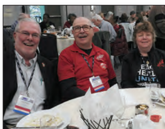
9—Gathering with affiliates